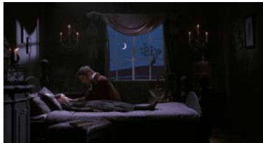
The Mole (Singapore)