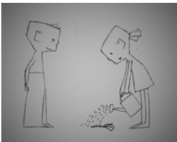
The Flower (Kyrgyzstan)

At "Short Shorts Film Festival Asia 2008", excellent short films gathered from all over Asia will be shown. All films will be screened for the first time in Japan.