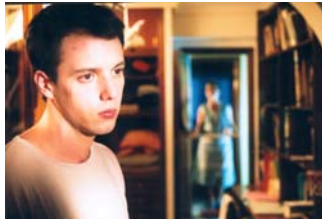
EVERY MINUTE, EVERY SECOND (Spain)