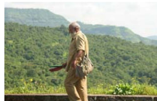
The Cabin Man (India)