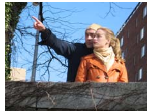
In Vivid Detail (Canada)