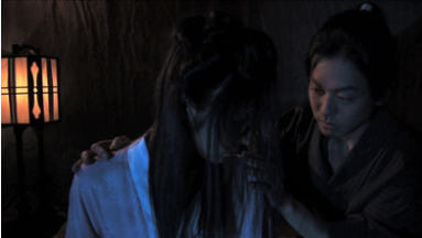
「Rock Hunter IEMON」

[Showtime: Monday, June 25. 6:00 p.m. – 7:30 p.m. @ Laforet Museum, Harajuku]