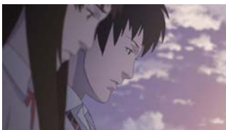
「BABY BLUE」 ©Genius Party

[Showtime: Wednesday, June 27. 11:15 a.m. – 12:45 p.m. @ Laforet Museum Harajuku]