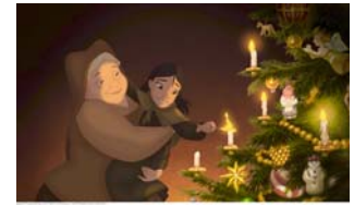
「The Little Matchgirl」

The second film is “The Little Matchgirl,” nominated at this year’s Academy Awards. It was directed by Roger Allers, who debuted as a director with the Oscar-winning film “Lion King” (1994) and solidified his status as a director in the world of animation and film industry. He was story supervisor for “Beauty and the Beast,” and created the storyboard for “Little Mermaid,” “Aladdin,” and “Lilo & Stitch.” This year’s Oscar-nominated film, “The Little Matchgirl,” – created by a director who has taken part in various high-profile films – is a must-see.